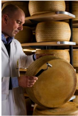
[...] each wheel undergoes strict tests for appearance, aroma and texture, before receiving the characteristic fire branding.