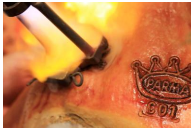
At the end of the ageing process, the hams are ready to qualify for the Parma Crown - the official stamp of certification. [...] Only hams with the high standard of the consortia are branded with the Parma Crown and become Parma Ham.