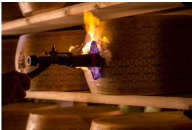
A four-leaf clover stamp confirms the origin and includes the Province's code and the producer's registration number. The pin-dot lozenges stamped on the rind are accompanied by the words <<Grana>> and <<Padano>>.