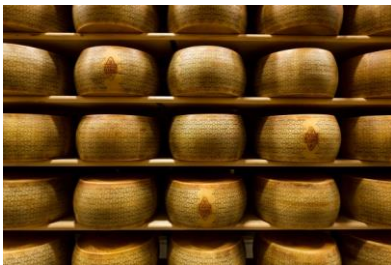
In 1996 Grana Padano became one of the first dairy products to be awarded the Designation of Protected Origin status.