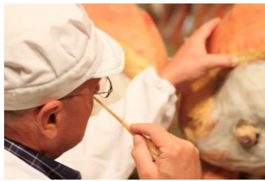
Qualified inspectors test the hams with a horse bone needle and issue a quality judgement based on the taste, colour and aroma;

The content of this publication represents the views of the author only and is his/her sole responsibility. The European Commission does not accept any responsibility for any use that may be made of the information it contains.